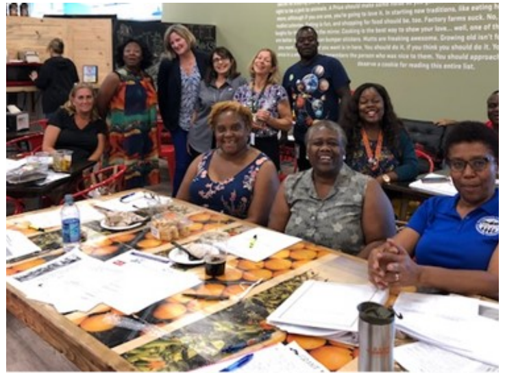
Grant Writing Workshop hosted by Broward Education Foundation and GAGP at Lucky's Market. Thank you BEF!

Please contact GAGP if you would like us to facilitate your next program planning meeting or to request a grant writing workshop for your school or Department.