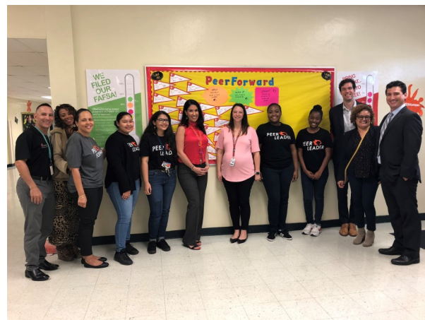
School Counseling & BRACE Advisement staff with students at Stranahan High School