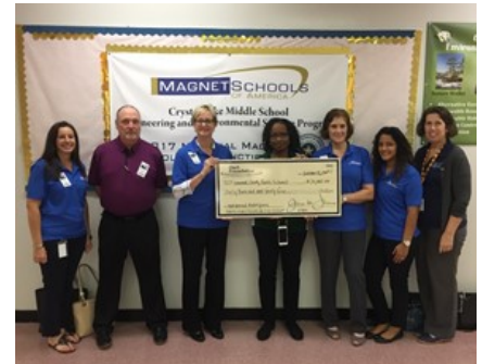
Dart Foundation representatives at check presentation event at Crystal Lake Middle School