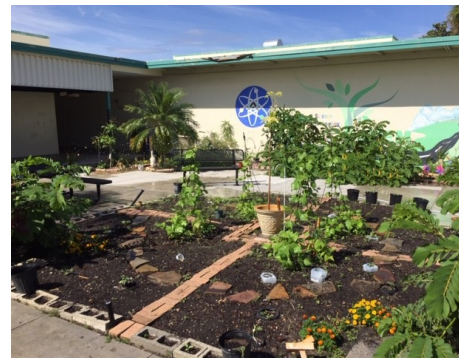
Edible Garden at Parkway Middle School