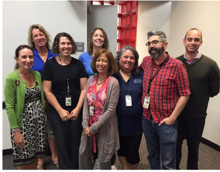
STEM team—Applied Learning Department

All Points North Foundation has awarded BCPS a grant of $60,000 to engage nearly 750 middle grade students in STEM and computer science to creatively solve problems by utilizing technology and engineering. This will create more